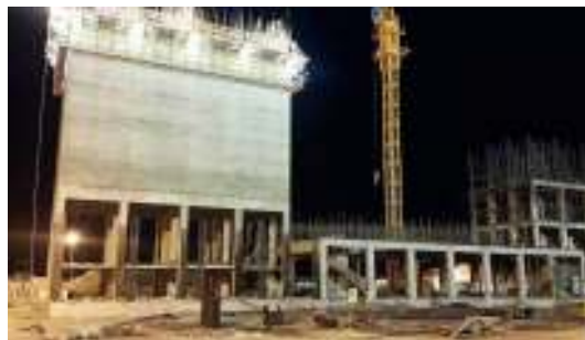
Sayga Flour Mill L Project-Slip Form