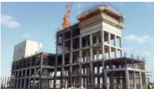
Sayga Flour Mill L Project

DAL Group-Khartoum-Sutrac Company-West Entrance project.