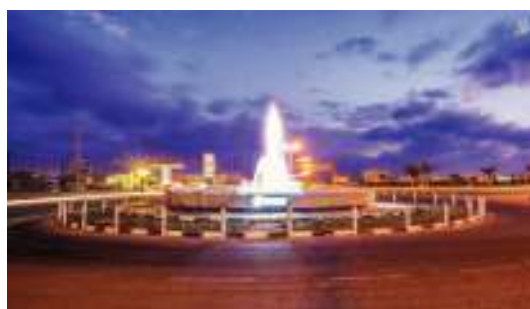
Sudan-Portsudan City Entrance Fountain