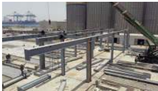
Sayga Flour Mill L Project-Store