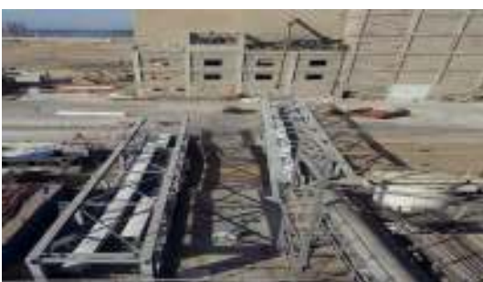
Sayga Flour Mill L Project-Catwalk-a Suspended bridge with 72 Meter length